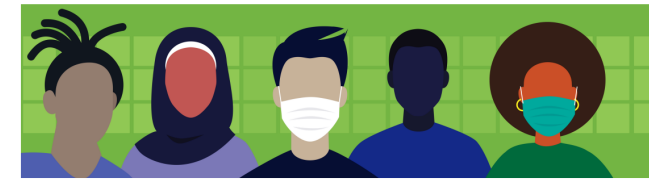
CALD COVID-19 Health Engagement Project (CCHEP)