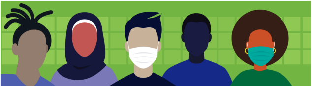
CALD COVID-19 Health Engagement Project (CCHEP)