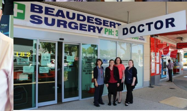
REFUGEE HEALTH IN QLD 2000 –